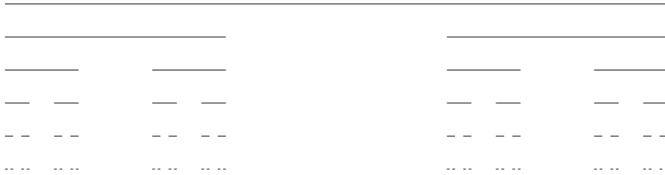
Figure 1: steps in the construction of a Cantor set.